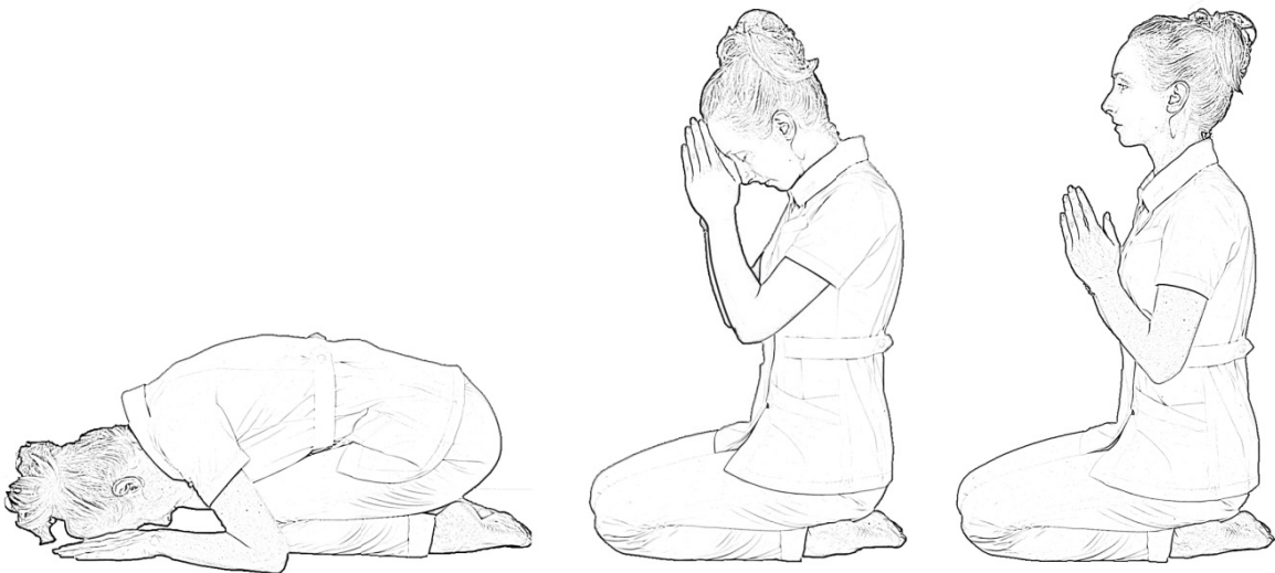
Figure 2 : Five Point Prostration (Women)